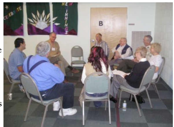
One of the discernment groups during the weekend